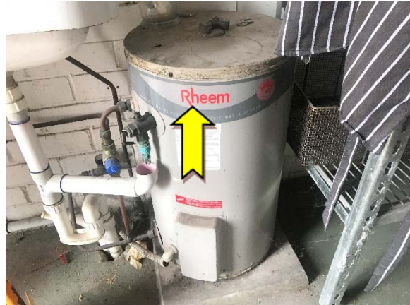
Photo 2. Interior, ground level, canteen, hot water heater – suspected SMF internal insulation.