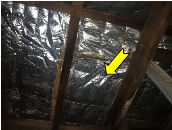
Photo 3. Interior, ground level, room 3, ceiling – suspected SMF sarking insulation.