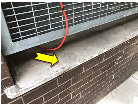
Photo 5. Exterior, throughout, window frames – suspected lead-containing white upper paint system.