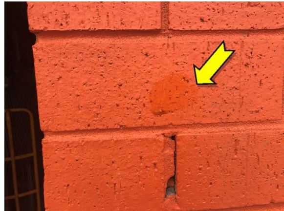
Photo 4. Exterior, throughout, walls – suspected lead-containing orange upper paint system.