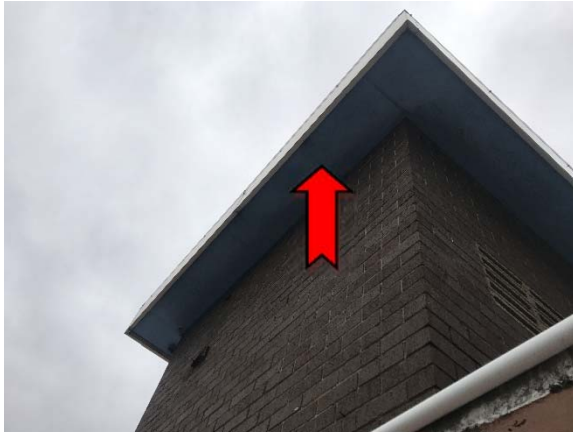
Photo 1. Exterior, throughout, eaves – suspected asbestos-containing fibre cement sheeting.