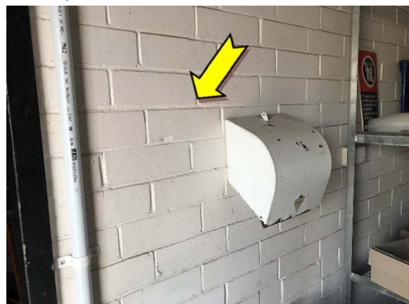
Photo 6. Interior, throughout, walls – suspected lead-containing white upper paint system.